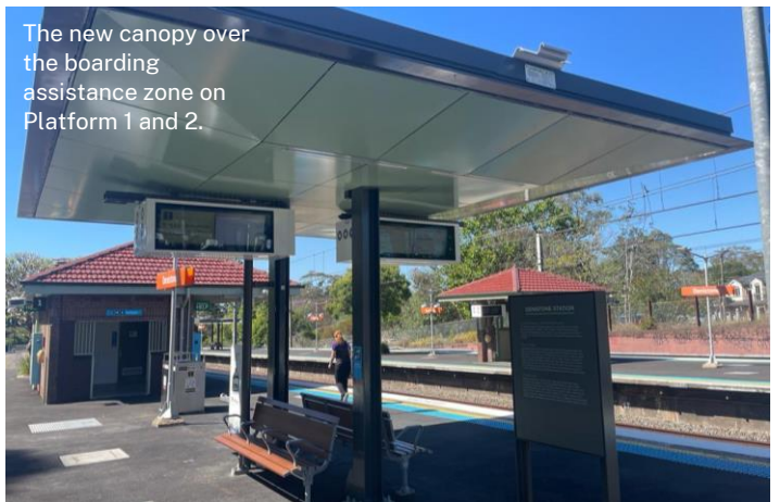
The new canopy over the boarding assistance zone on Platform 1 and 2.