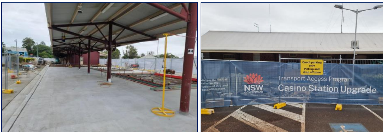
Work continues at Casino Station

Areas will remain fenced off and temporary access arrangements will remain in place while the new surface is installed.