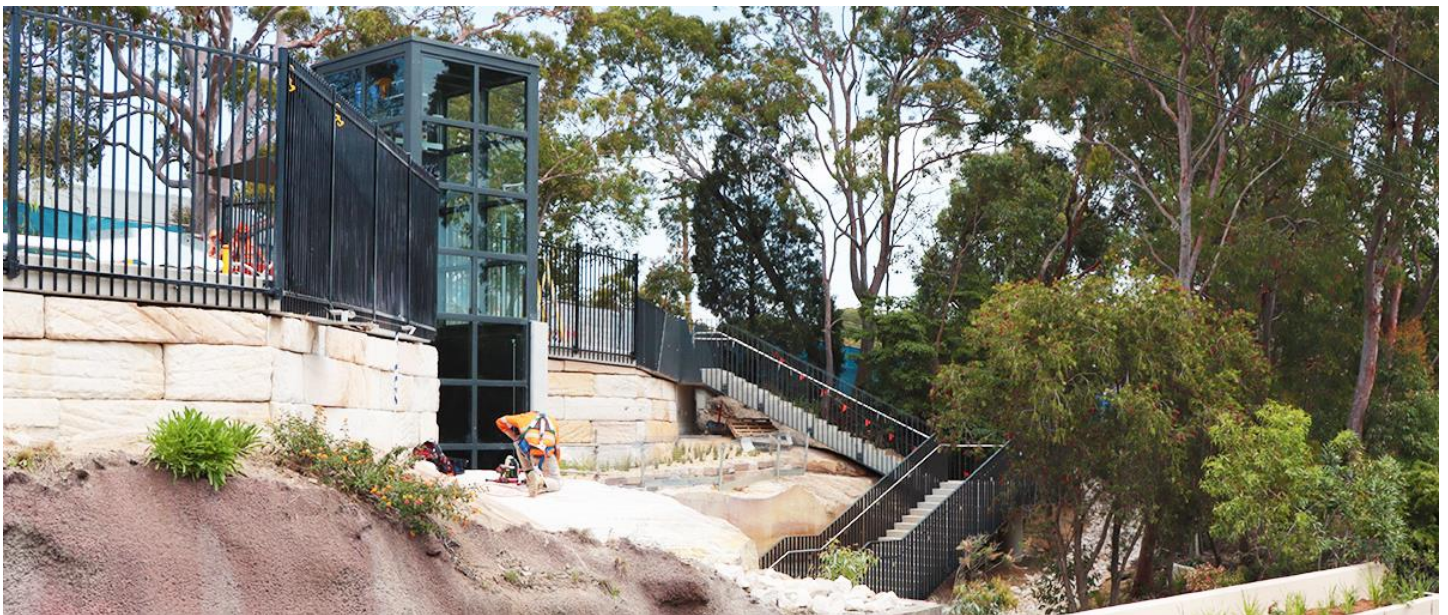
Finishing touches being done, before opening of the lift and stairs from Como Parade to the underpass.