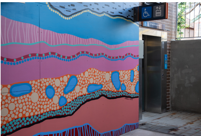
Improvements to the underpass, including a new lift and artwork

Transport for NSW would like to take this opportunity to thank the local community for its patience and understanding while we completed this important upgrade.