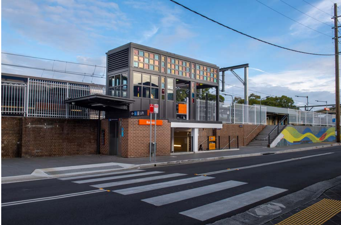
The upgraded station viewed from Railway Street