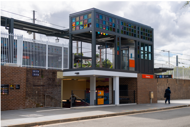
The upgraded station viewed from Hattersley Street