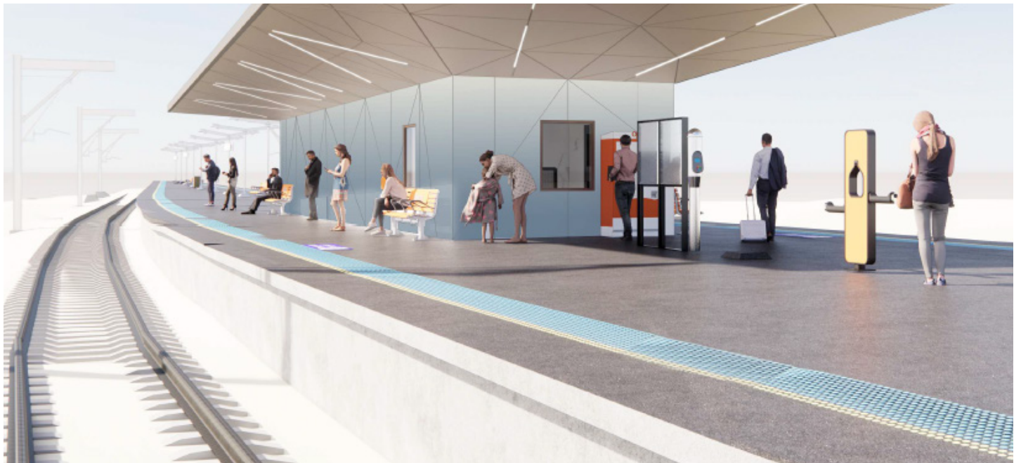
Pictured: Artist's impression of new Bellambi Station building.

The NSW Government is improving accessibility at Bellambi Station. This upgrade is being delivered as part of a NSW Government initiative to provide a better experience for public transport customers by delivering accessible, modern, secure and integrated transport infrastructure across the state.