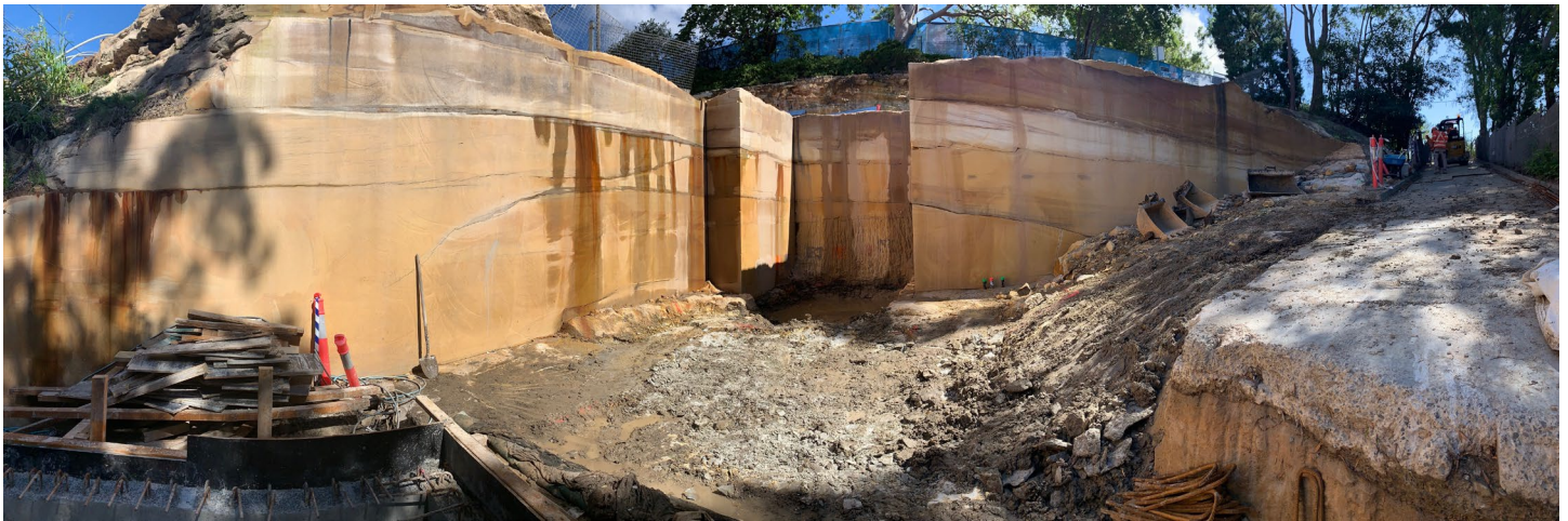
Image: Excavation detail on Como Parade, April 2021

Transport for NSW is upgrading Como Station to make it easier for everyone to access, including people with a disability or limited mobility, parents/carers with prams, and customers with luggage.