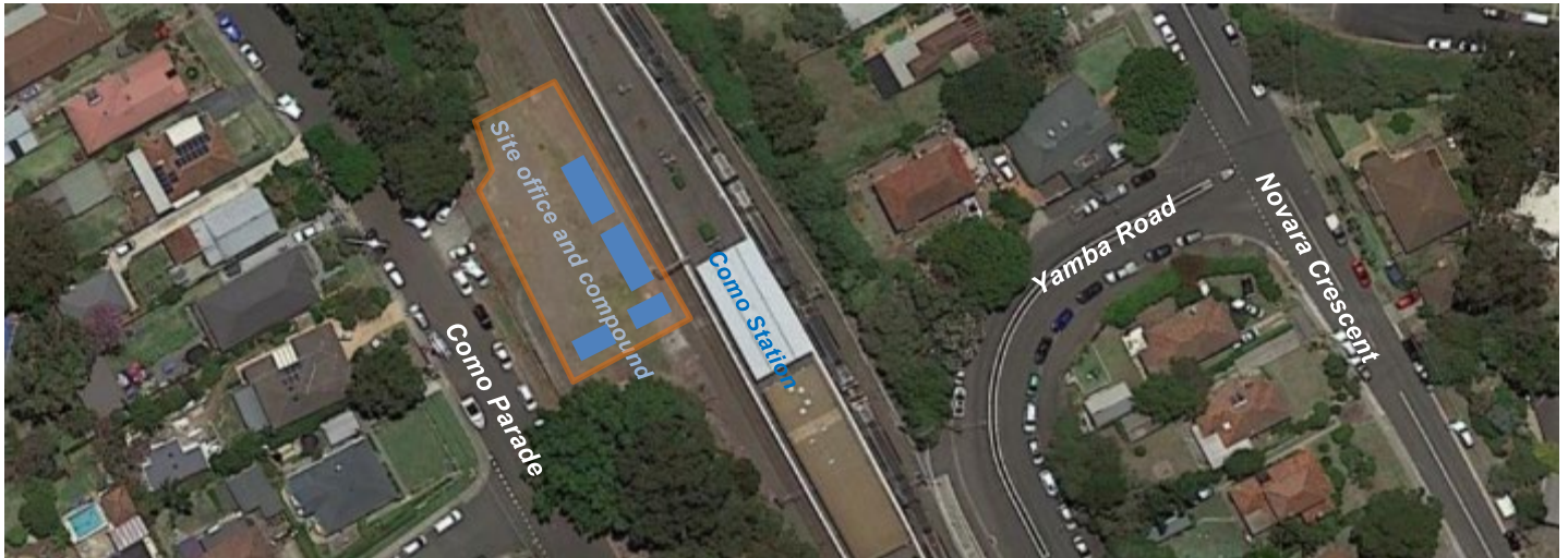
Location of site compound at Como Station.

Work to establish the site compound will involve the use of a 55-tonne crane, various construction vehicles and hand tools. This compound will be located on the Como Parade side of the station within the rail corridor, as indicated by the image below.