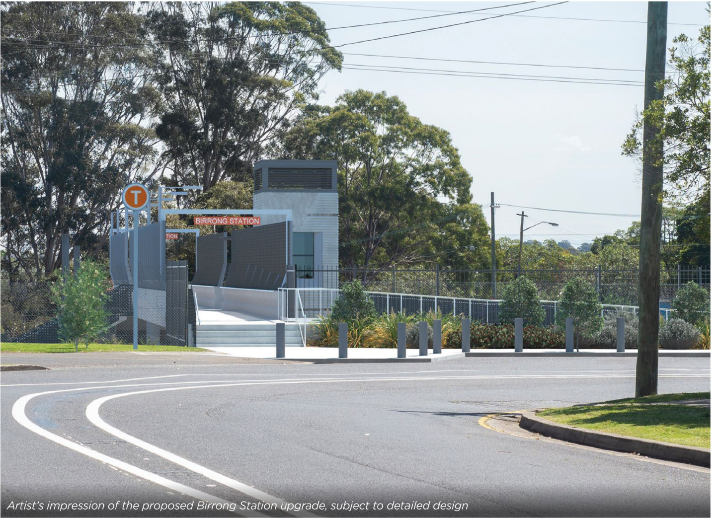
Artist's impression of the proposed Birrong Station upgrade, subject to detailed design