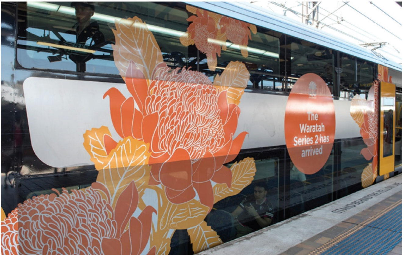
Artwork on the first Waratah Series 2 train

The entire Waratah Series 2 fleet trains will progressively come into service over the next six months.